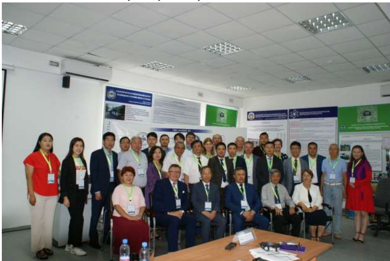
Picture 1. Group photo of the Workshop organizers, speakers and participants