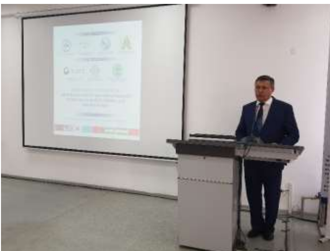
Picture 21. Closing remarks given by Mr. Maxat Elemesov, State Committee on Forestry and Wildlife, Republic of Kazakhstan