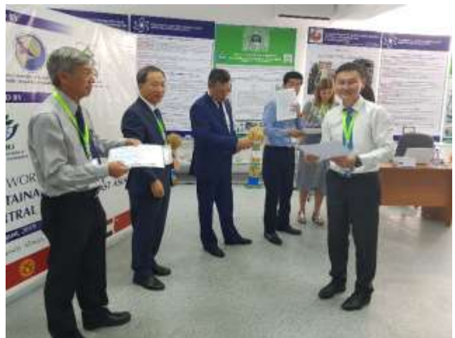
Picture 23. Delivery of Certificate of Participation to all participants