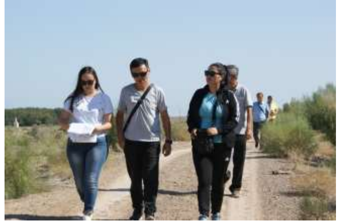
Picture 25. Field trip to Charyn State National Natural Park and Relict Ash groves ( Fraxinus Sogdiana Bunge.) and active discussion on dryland vegetation and restoration were taken in place throughout field session