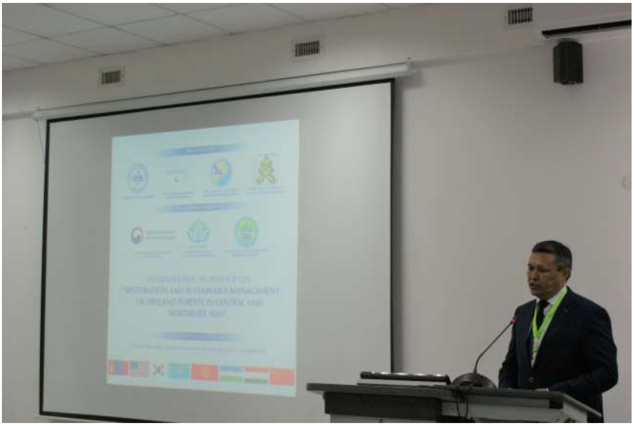
Picture 4. Congratulatory Remark: Maxat Elemesov, State Committee on Forestry and Wildlife, Republic of Kazakhstan