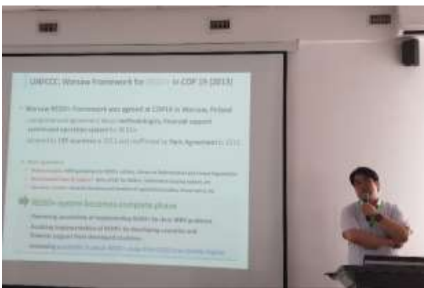
Picture 14. Presentation by Korea (Dong-Ho, Lee) International support for implementation of REDD+ in developing countries and implications