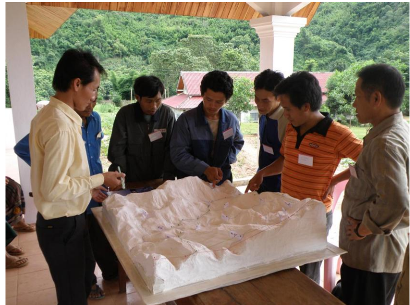
Landuse planning in Laos